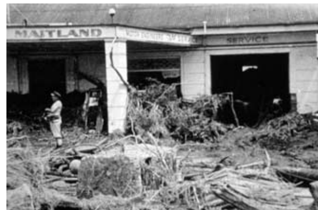
Flood debris in the Maitland commercial area after the 1955 flood