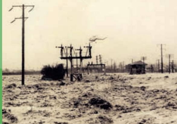
Infrastructure may be badly damaged in a severe flood

Because evacuation routes close early in severe floods, you and your employees will need to leave well before water reaches your business. It is dangerous to evacuate too late in a flood as roads may be covered by deep, fast flowing water.