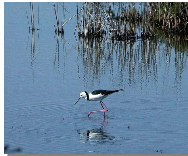
Black-winged Stilt on Wader Pond

Sponsored by: Kooragang Wetland Rehabilitation Project