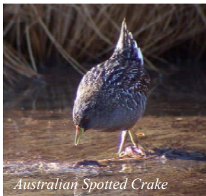
Australian Spotted Crake

9. BELL FROG TRACK: A vehicle with high clearance is required to negotiate this track comfortably. Good elevated views into the northern parts of Swan Pond and Wader Pond can be obtained from this track. Keep a lookout for Brown Quail, Golden-headed Cisticola, Little